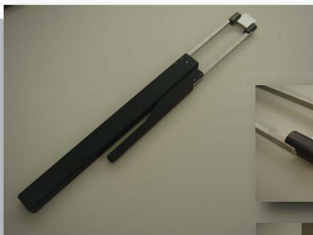
Mechanical Edge Grip Picks