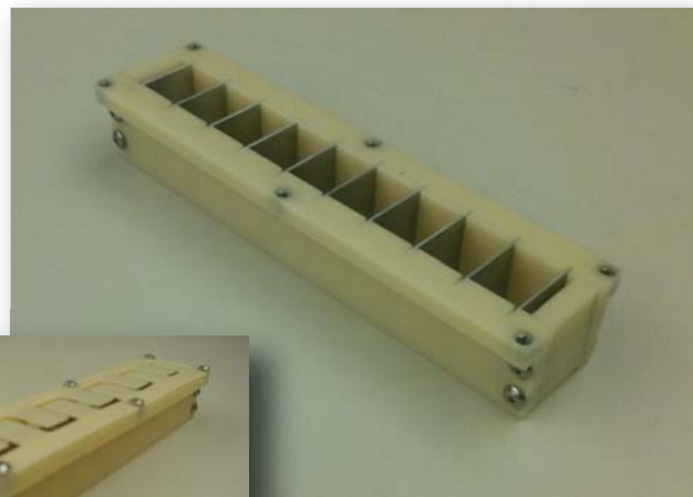
Custom "Chip" Cassettes with Shipping Lid